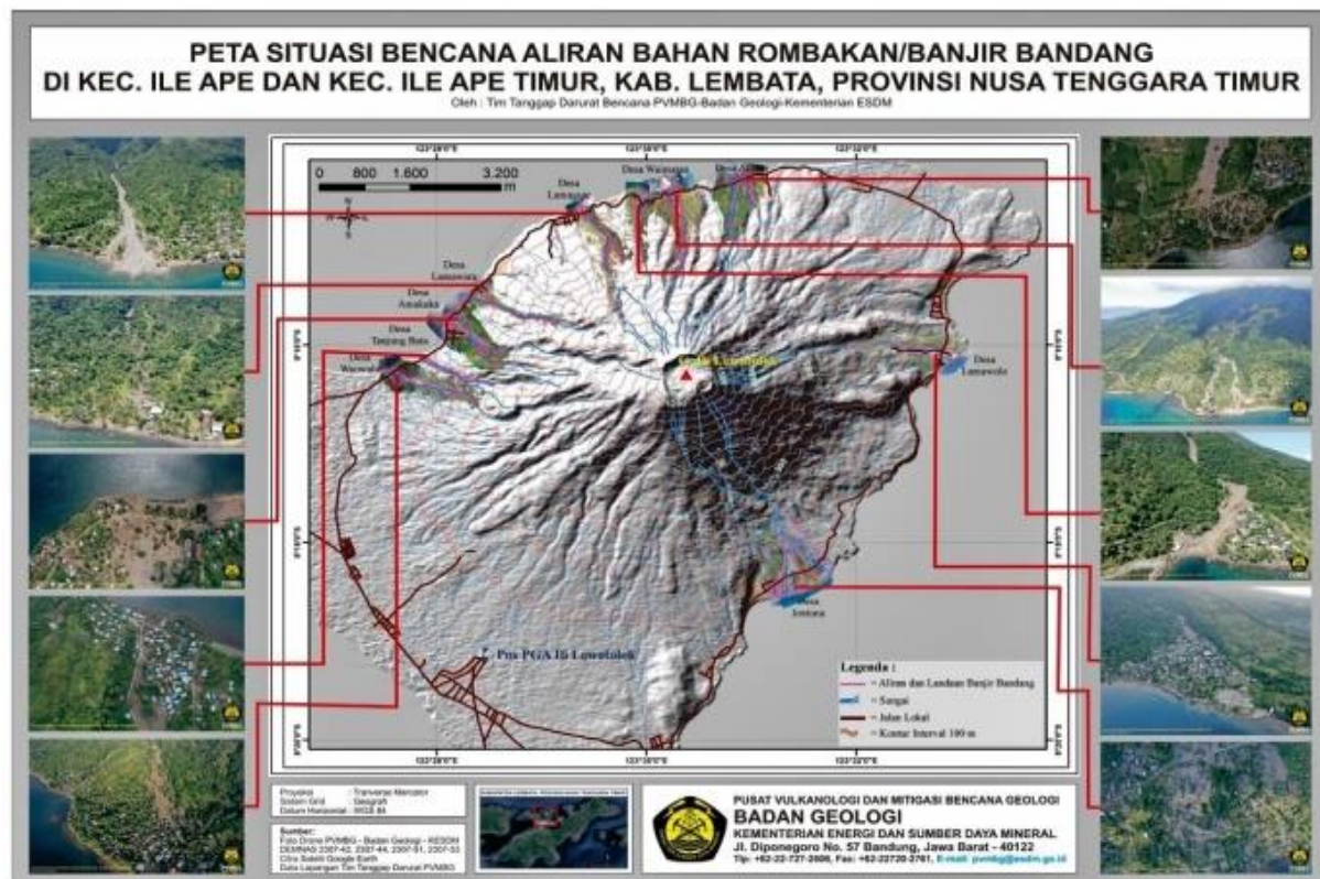
Figure 2: Flood Disaster Situation Caused By Rain And Cyclone Seroja