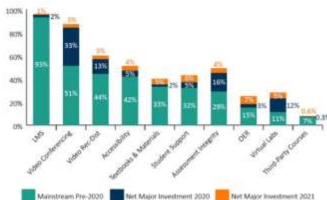
Figure 1. The use of technology in education Pre-2020, 2020 and 2021.

Today, technology is developing rapidly. This is in line with the need for technology in human life. Its development has penetrated all aspects of human life, for example in economic, political and cultural aspects. It is also inevitable in the aspect of education. Where thanks to technology, aspects of education have progressed very rapidly. With technology, the implementation of learning becomes more effective and efficient and the implementation of this education is not limited by space and time (Noriska, 2021). Furthermore, Kelly (2021) stated that there was an increase in the use of technology. The Changing Landscape of Online Education (CHLOE) 2021 Survey which is a survey institution in higher education in the United States which is carried out every year that discusses online learning in terms of structure and organization. The institute found that there had been very different changes in the use of technology in education in 2021 compared to 2019.